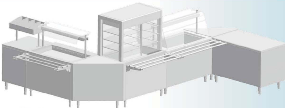
Self service corner with adjustable feet