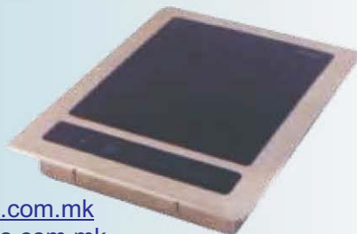
INDUC-I 440x580x90 2,8 kw