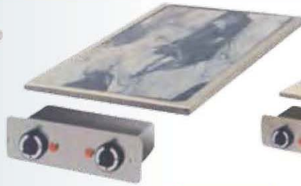
PC1V-BSI 400x600x150 3,5 kw