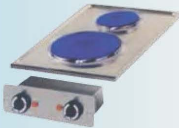
PC1E-BSI 400x600x150 3,5 kw