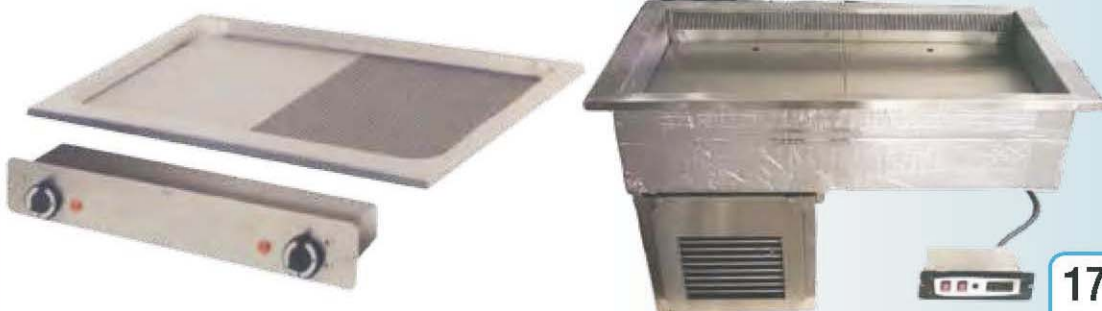
FT2LR-BSI 600x600x150 8 kw