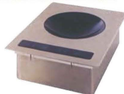
WOK-I 440x580x170 3,6 kw