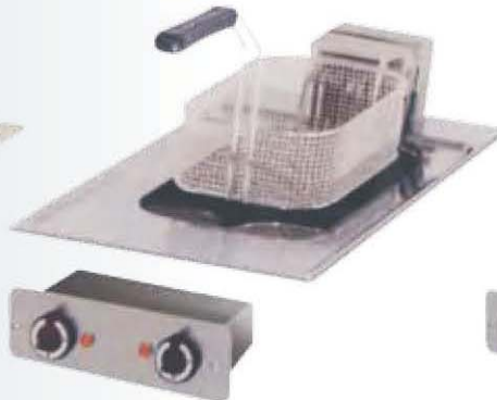
F18/IR-BSI 400x600x260 7 kw