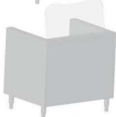
Front cover for moving trolleys

Stainless steel construction, 2 power supplies left, right