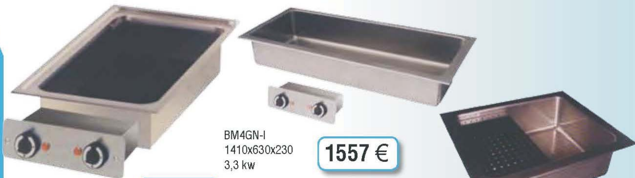
BR1-BSI 400x600x220 4 kw