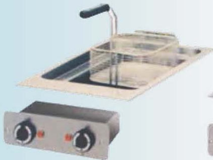
F8M/IR-BSI 400x600x200 3 kw