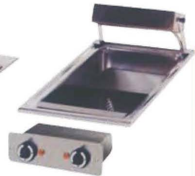
SF1-BSI 400x600x150 0,65 kw