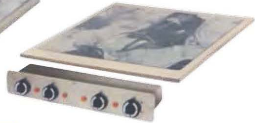
PC2V-BSI 600x600x150 6,6 kw