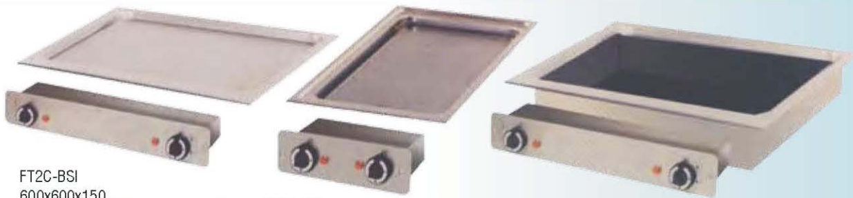
FT2C-BSI 600x600x150 8 kw

••••• CATERING EQUIPMENT FOR HOTELS, RESTAURANTS, CANTEENS, CAFES