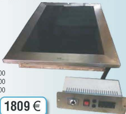
ENGINDUC 1200x600x200 1700x600x200 2200x600x200