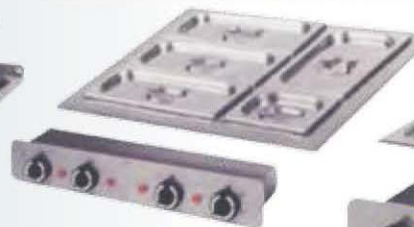
BM60-BSI 600x600x220 2,1 kw