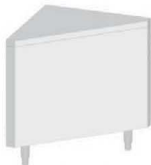
Working table with shelf and adjustable feet