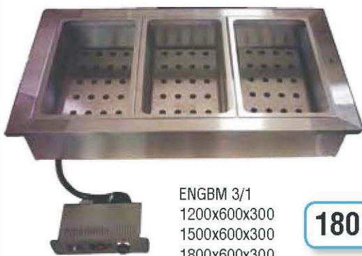
ENGBM 3/1 1200x600x300 1500x600x300 1800x600x300