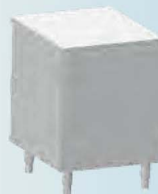
Working table 600x700+350x850