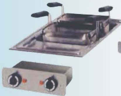
CP1-BSI 400x600x260 4 kw