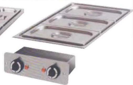
BM1-BSI 400x600x220 1,2 kw