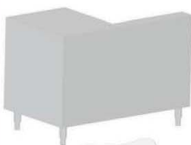
Front base for cooking machines

Stainless steel construction, 2 power supplies left, right Opening Securite crystals