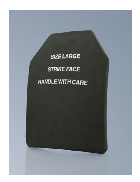
ESK boron carbide system (German SK 4 - protection)

Optimum personal protection together with maximum mobility thanks to minimum weight are the key prerequisites for safe and successful deployment. ESK's innovative ballistic protection materials surpass conventional armor systems.