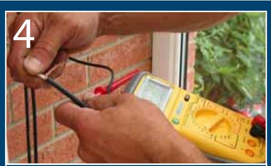
The heating cable and floor sensor are tested prior to screeding.