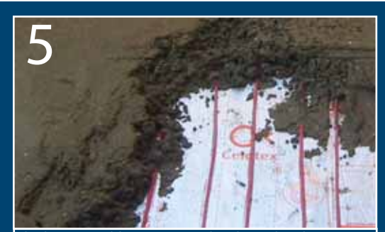
The heating cables are covered with sand and cement screed. Once the screed is dry, the heating should be turned on gradually over a 48 hour period.