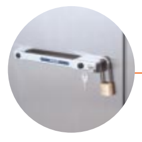
Cylinder key locks are standard on open end units. Padlocks can be used for increased security.