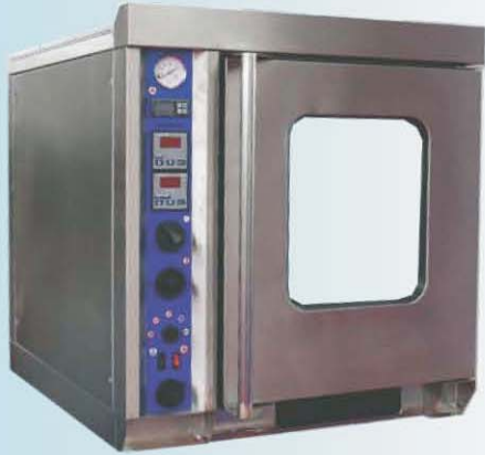
CONV - 6E COMP -6E