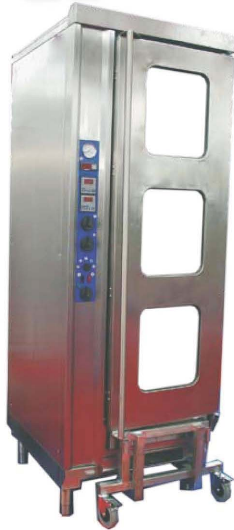
CONV - 20 E COMP -20 E