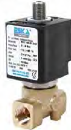
ESV 506 (3/2,N.C)

1: Inlet 2: Outlet (Body) 3: Outlet (Enclosing Tube) De-energised: 1-3 Energised: 1-2