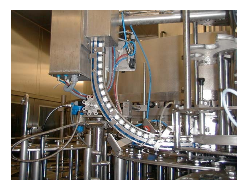
UVATEC used for the disinfection of screw caps in the beverage industry