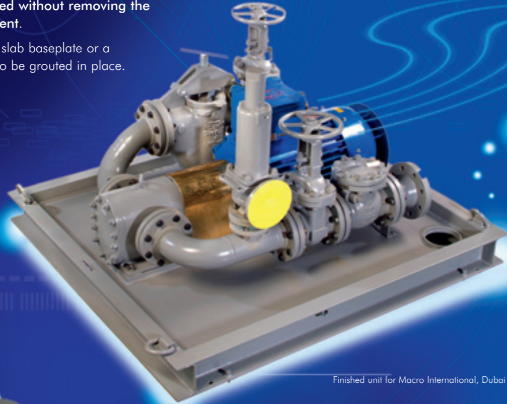
Finished unit for Macro International, Dubai

Varley design using a 3D CAD system. These can be used by the system designers to agree space and connection constraints.