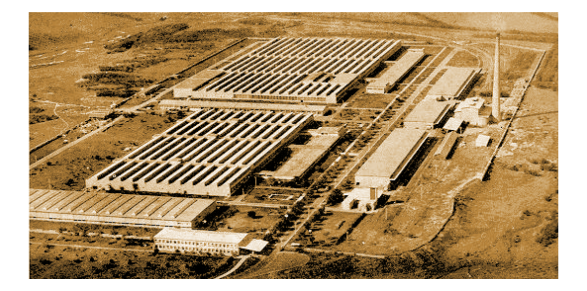
Aerial picture of the colossal buildings of Makedonka in the socialist past

When one comes in the complex of Makedonka on his left he first sees the yellow administrative building where the whole process of production in the factory was planned and administered/managed. Next to the entrance door of this management building there is a plaque announcing the beginning of production of yarn in Makedonka in 1953 when the spinning mill was handed over to the workers of the factory. Further down the main street (there are two parallel streets that go through and around the Makedonka compound) one can see on the left side a huge production facility where the Macedonian fabrics were created, whereas on the left side there are the storage facilities next to which a railway is passing. This is where the trains used to stop at Makedonka while the yarn and fabrics were loaded to be transported throughout the former Yugoslavia and Europe.