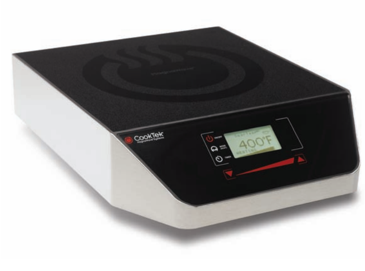
Apogee Freestanding Cooktop