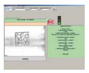
Traceability software (Data Matrix analysis and verification)