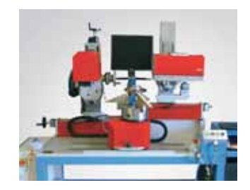
Multi-axis marking station for helicopter turbine