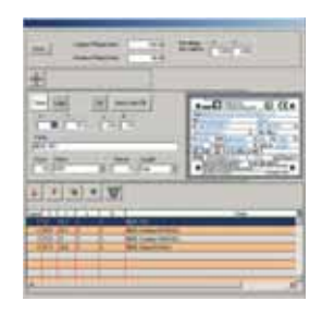
Custom tag-marking software