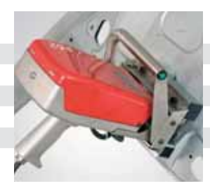
Custom clamping system