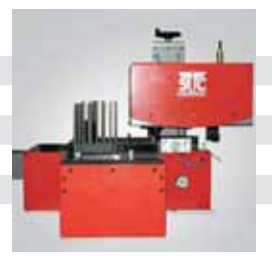
Automatic tag feeder