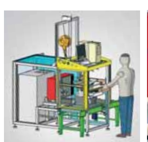
Engine drilling and marking