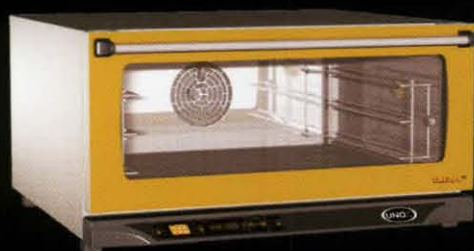
XF 185 ELENA Dynamic