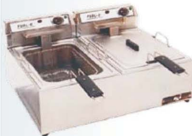
Table top double electric fryer with two removable basin 2/3 and 150 mm deep. Stainless steel construction. Equipped with 2 thermostats 50-200°C and OFF position, pilot lamps, power indication lamps and 2 thermal fuses 230°C. 2 Micro-switch at the head of the unit to cut the power by removing the head. Baskets with breakable handle

Operation voltage: 230 VAC/50-60Hz Power: 2*3200W Bucket dimensions: 354*325mm Dimensions: 630x330x330mm Capacity: 2*10 lit.