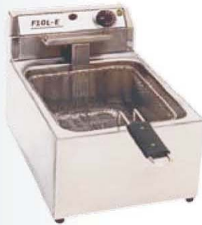
Table top single electric fryer with one removable basin 2/3 and 150 mm deep. Stainless steel construction. Equipped with thermostat 50-200°C and OFF position, pilot lamp, power indication lamp and thermal fuse 230°C. Micro-switch at the head of the unit to cut the power by removing the head. Basket with breakable handle

Operation voltage: 230 VAC/50-60Hz Bucket dimensions: 354*325 mm Power: 3200W Dimensions: 360*330*330mm Capacity: 10 lit.