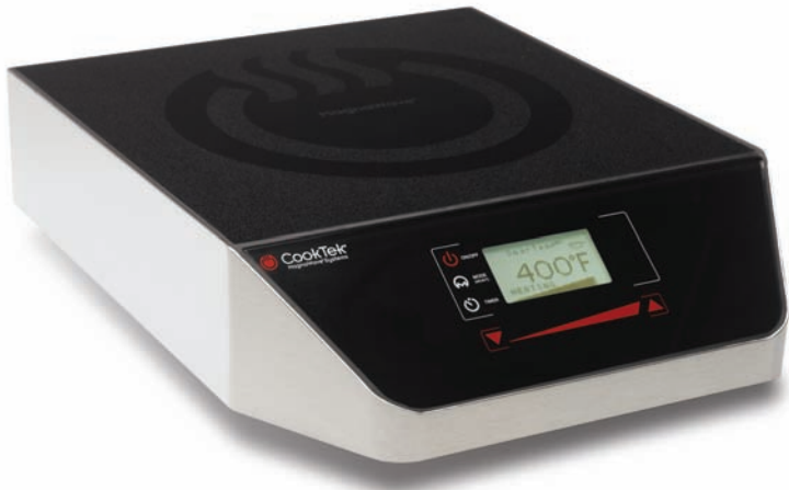
Apogee Freestanding Cooktop