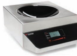
Apogee Freestanding Wok