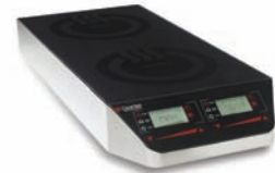
Apogee Freestanding Front to Back Double Hob