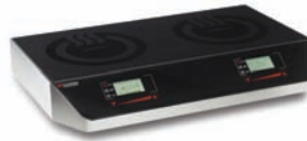
Apogee Freestanding Side by Side Double Hob