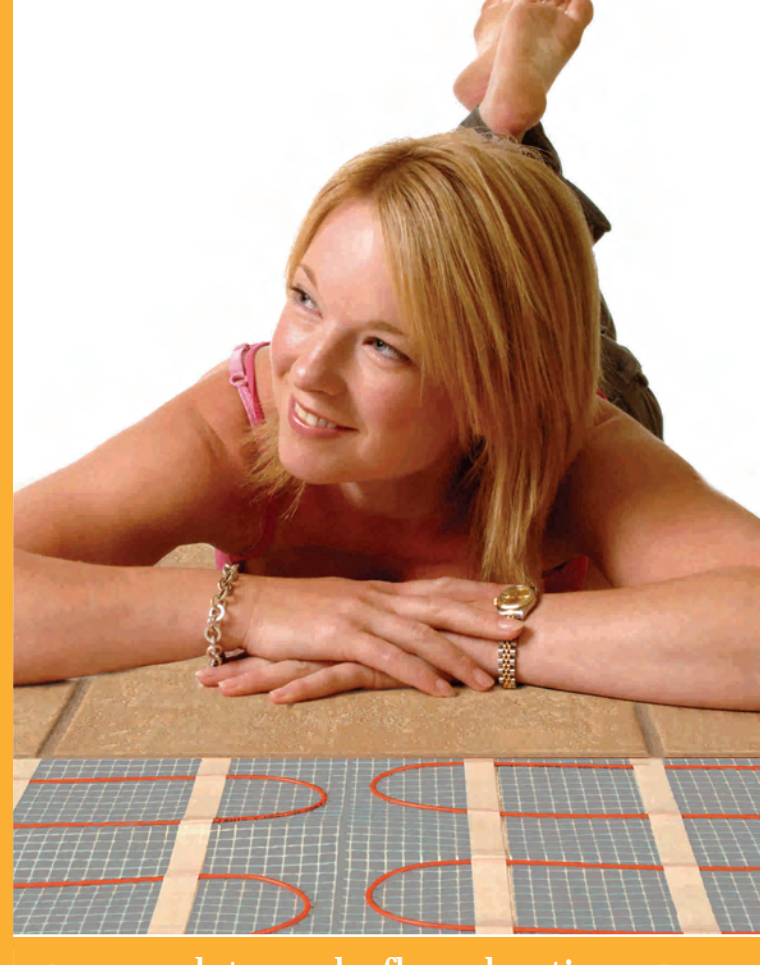
The complete underfloor heating solution for all tile, stone, marble & porcelain floors.