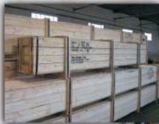
packing in seaworthy wooden cases